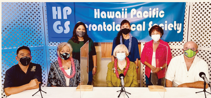
The Hawai'i Pacific Gerontological Society conference committee during the 2021 biennial conference that was held via Zoom from Ala Moana Hotel by Mantra.

Individuals, companies, nonprofit organizations and government agencies join HPGS to have a seat at the table when it comes to kūpuna and their families being educated, informed and associated with professionals in gerontology. The organization's biennial two-day conference will be held at Ala Moana Ho-